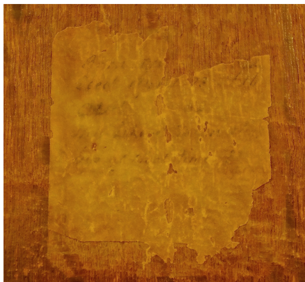
Label on the back of the Sanders Portrait of Shakespeare.